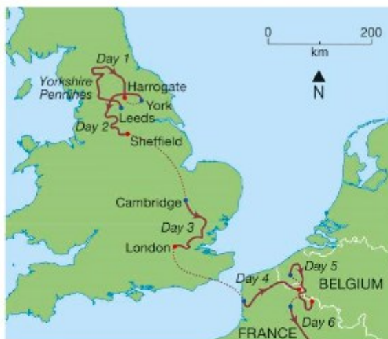
▲ Figure 1 The start of the Tour de France in 2014