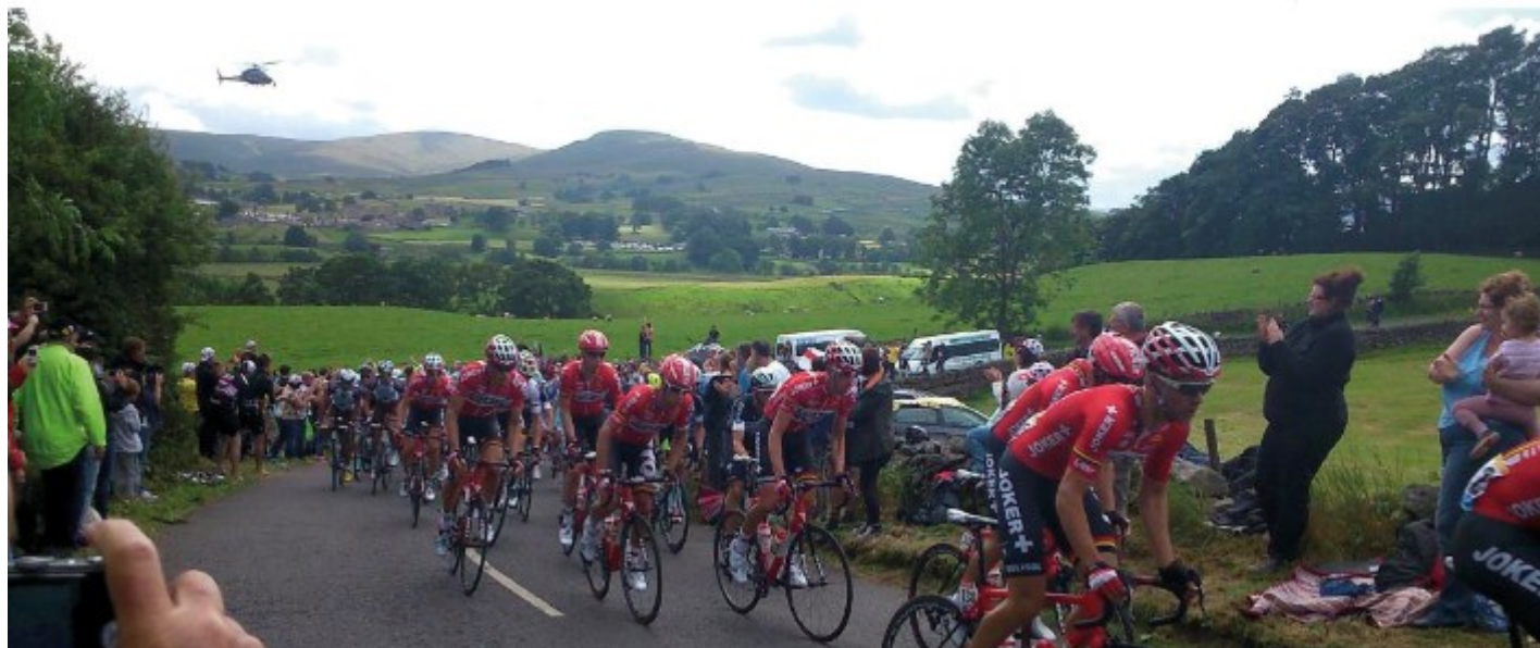
▼ Figure 2 Tour de France cyclists in Yorkshire's Pennine landscape

What we call 'Yorkshire' is actually four counties: West, South, and North Yorkshire, plus the East Riding. Over the years, the Yorkshire region has varied in size – depending on boundary changes by different governments – but at its core is a sense of identity; if you think you're from Yorkshire, then you are!