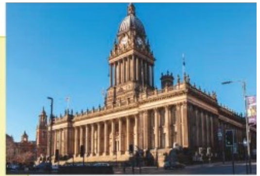
Figure 3 Leeds Town Hall – typical of the imposing civic buildings of many northern towns and cities, built during their Victorian industrial heyday